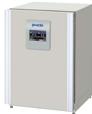
MCO-170AICD/MCO-170AICDL 165 L MCO-170AICUVD/MCO-170AICUVDL