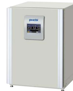
MCO-170M 161 L MCO-170ML