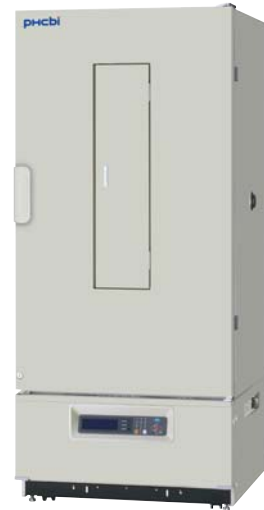
MIR-554 406 L