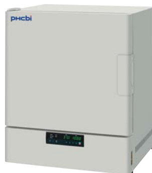
MIR-H263 153 L