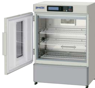
MIR-154 123 L