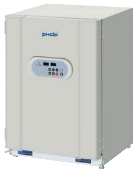
MCO-18AC 170 L