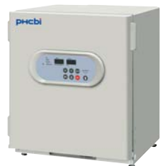
MCO-5AC 49 L