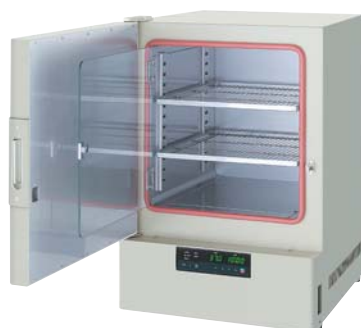
MIR-H163 93 L

Intuitive and easy operable Heated Incubators