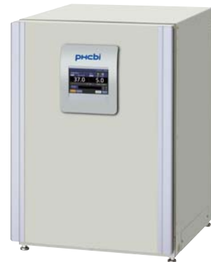
MCO-170AIC/MCO-170AICL 165 L MCO-170AICUV/MCO-170AICUVL MCO-170AICUVH/MCO-170AICUVHL