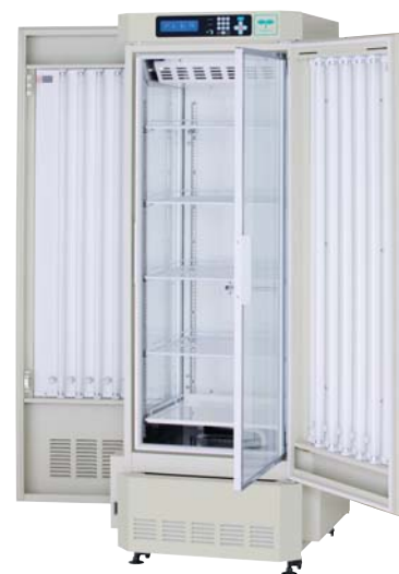
MLR-352H 294 L