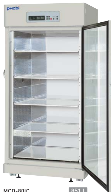
MCO-80IC 851 L

* External dimensions of main cabinet only - see dimension drawings on flyers showing handles and other external projections.