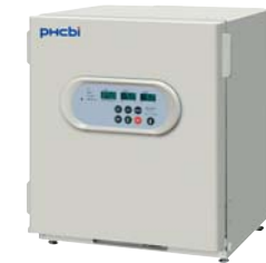
MCO-5M 49 L