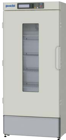
MIR-254 238 L