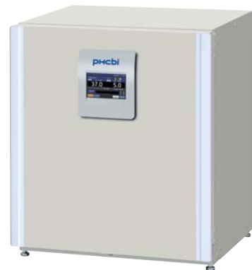
MCO-230AIC/MCO-230AICL 230 L MCO-230AICUV/MCO-230AICUVL