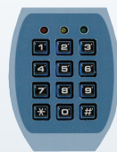
Horizon access keypad