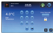
i.C 3 access control homescreen