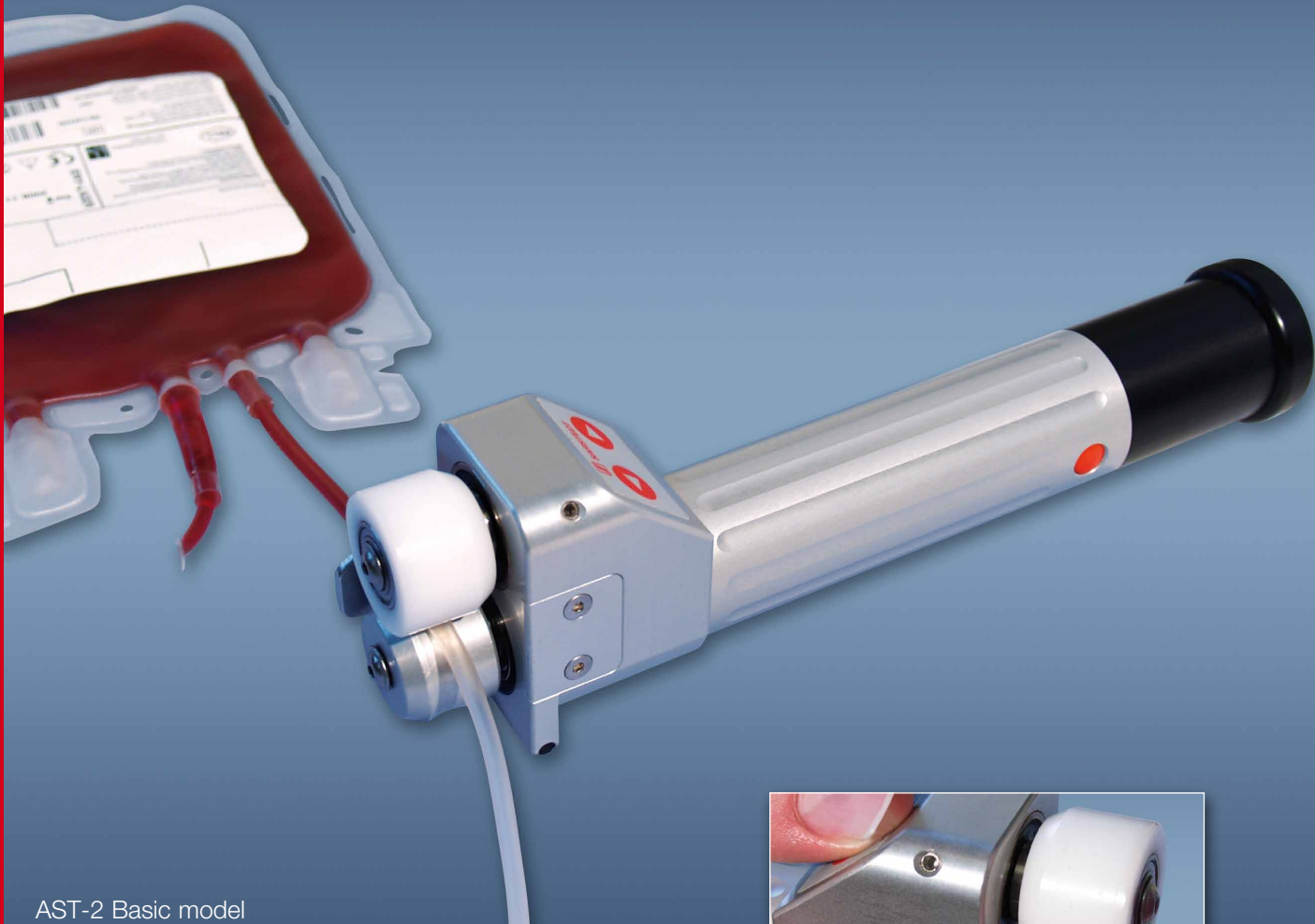
AST-2 Basic model